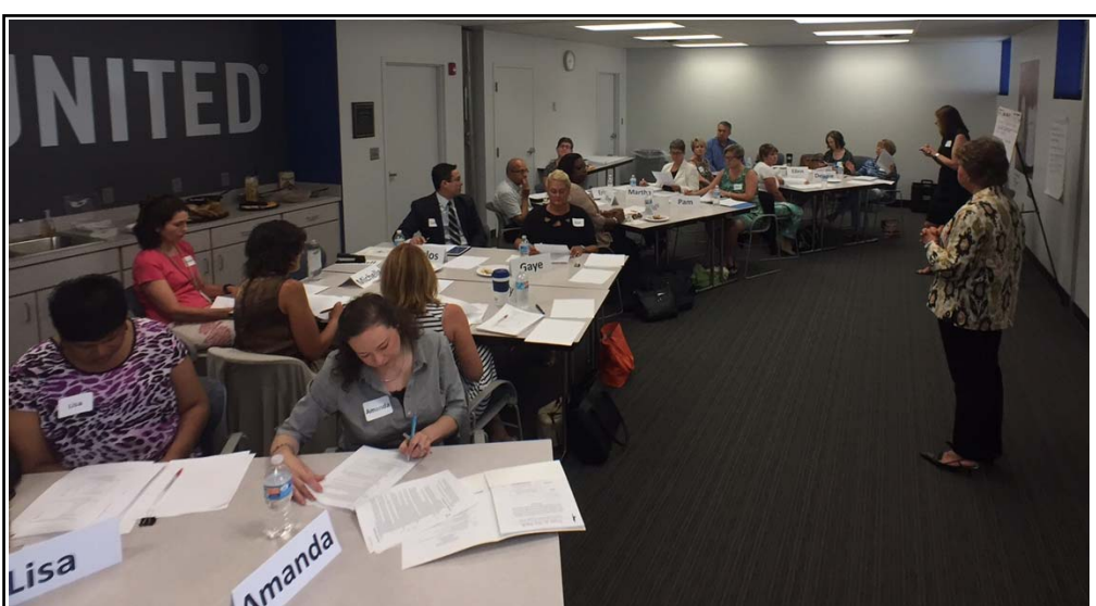
Community Health Council members examine and evaluate the top twenty health issues that emerged from CHA data. (June 18, 2015)